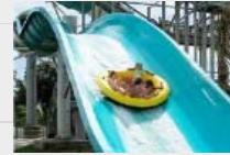
Best Water Parks In Fla. Summer+Water+Family FUN!