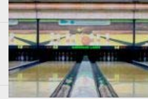
Best Bowling Alleys In South Florida Strike!!