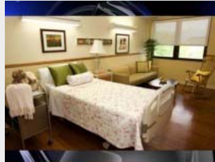
Best Hospitals For Expecting Moms