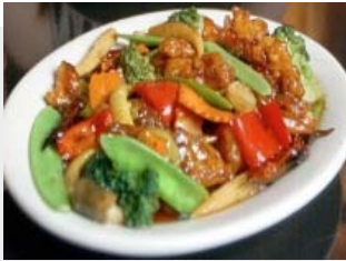
Best Chinese Food