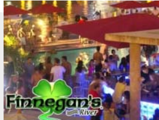
Best Riverfront Restaurant Bars