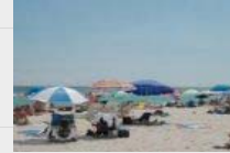
Best Nude Beaches In South Florida Clothing optional beaches!