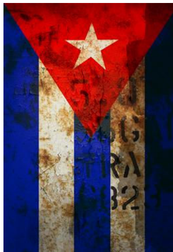
Distressed cuban flag