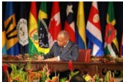
Trinidad Prime Minister Patrick Manning signs the final declaration.