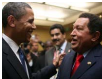
Presidents Barack Obama and Hugo Chavez at the Summit of the Americas.

In this regard, the recently concluded Fifth Summit of the Americas in Trinidad and Tobago did not disappoint. Searching for substance in the 21-page Declaration is akin to looking for a polar bear in a snowstorm. Platitudes, hopes, aspirations, and altruistic pledges laden in non-specifics embody the Declaration—a document issued before not after the Summit ended (sort of like going to the theater to watch a movie, then returning home to boot up the computer and watch the trailer). Moreover, the document itself was signed by one head of state only---Patrick Manning, prime minister of the host country.