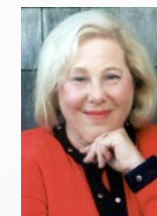
Rosabeth Moss Kanter January 14, 2014

Rosabeth Moss Kanter holds the Ernest L. Arbuckle Professorship at Harvard Business