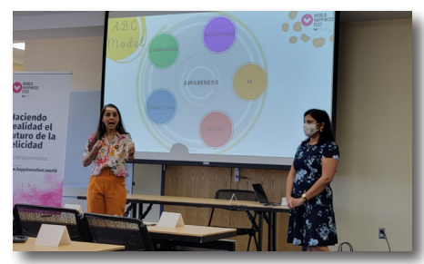
Event at the World Happiness Fest.