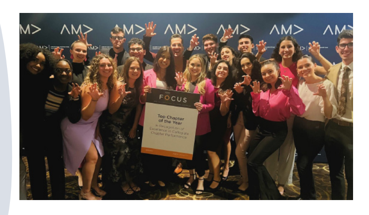
AMA FIU Chapter.