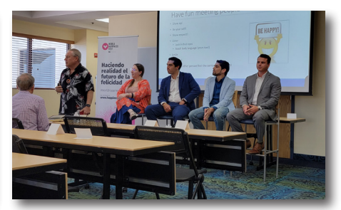
Event at the World Happiness Fest.