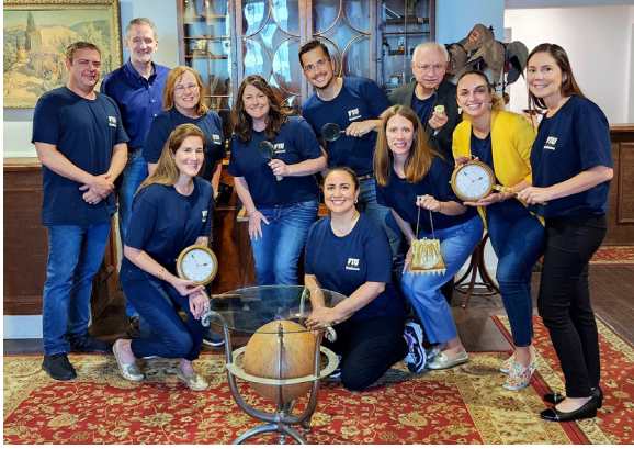
MSM team retreat attendees.

The MSM retreat took place at Miami Escape Hunt, an escape room experience where faculty and staff of the MSM program engaged in fun, team building, and productive course collaboration discussions. Participants were placed in a room and had to escape within the allotted time working together while figuring out the necessary clues. After each team escaped, we discussed our process, areas of improvement to collaborate better as a team, and celebrate each members' unique contributions for solving the puzzle and finally escaping. This experience was extremely valuable and facilitated brainstorming ideas to improve program content and student services.