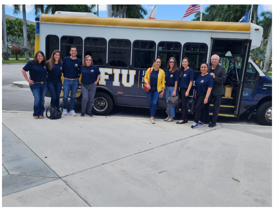
MSM team getting ready to leave to Miami Escape Hunt on the FIU