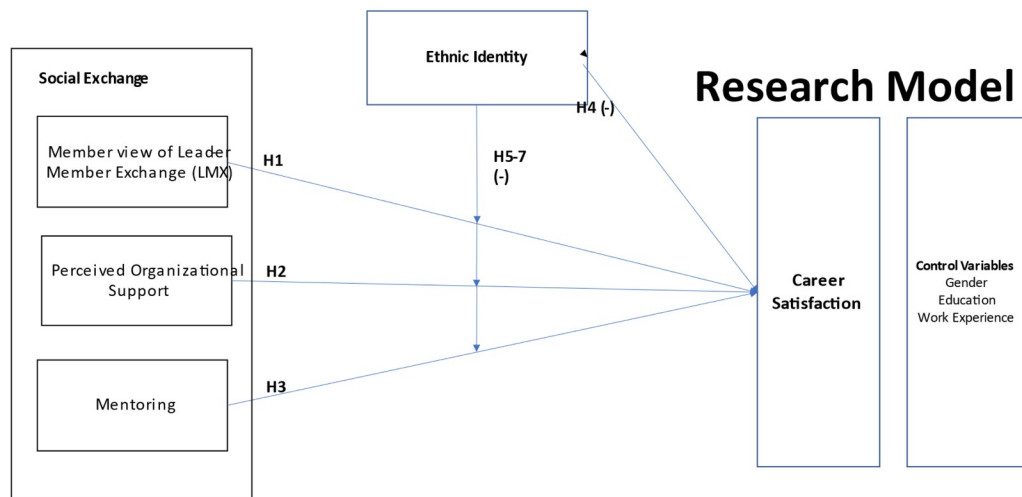
Figure 1: Preliminary Research Model