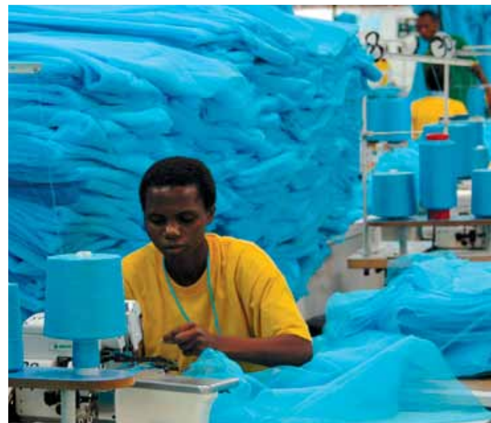
A-Z Bednet Factory, manufacturer of bed nets with insecticide to prevent malaria

Another visit, to the Apartheid Museum in Johannesburg, provided “heart-wrenching evidence of the abuse of that time,” she said.