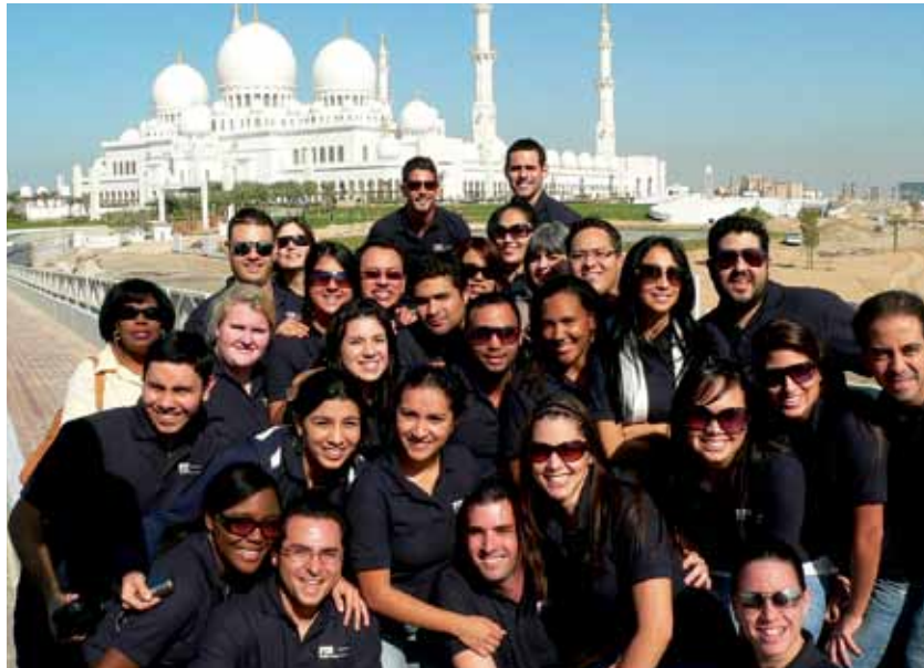
Left: Twenty-eight students, pictured here outside the Mosque in Abu Dhabi, participated in a ten-day study abroad program in Dubai, one of many such student programs FIU-CIBER organizes.

“This grant recognizes our commitment to innovative program delivery and timely research in the international business arena,” she said.