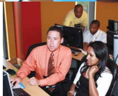
Groups of outstanding high school and community college students learned about accounting during FIU summer residencies.

reach programs. They mentored, proctored in the dorms and fielded questions.