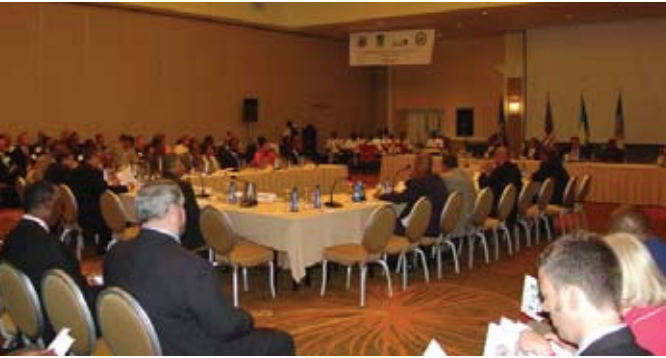
Decision makers on energy and the environment from the Caribbean met with potential investors at a conference in Nassau, Bahamas, organized in part by the Energy Business Forum.

Take 250 decision makers on energy and the environment from across the Caribbean, put them together with potential investors, and a whole new kind of energy gets generated.