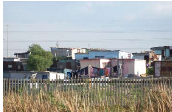
On the outskirts of Johannesburg, entrepreneurial activity thrives. Vendors sell almost anything the average household needs, and profits stay in the community.

In addition to the many occasions on which they met with business and government officials, the group toured a working gold mine and game reserves, one of which boasts an effective anti-poaching education program.