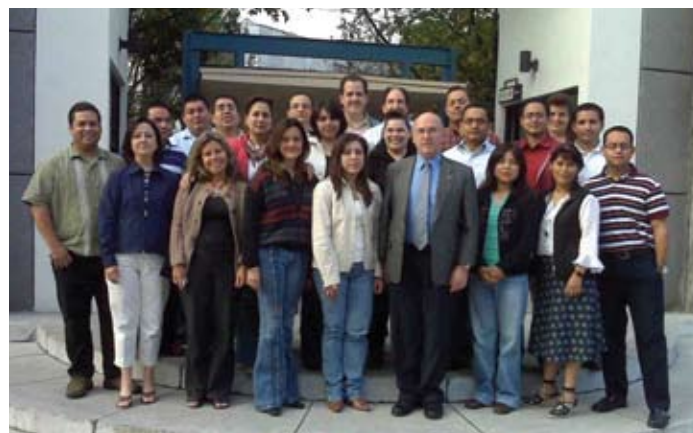
The first group of students in the MACC in Mexico program, on the campus of ITAM